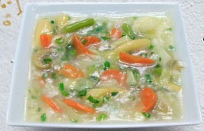
CV 03 MIX VEG IN GARLIC SAUCE 2.400