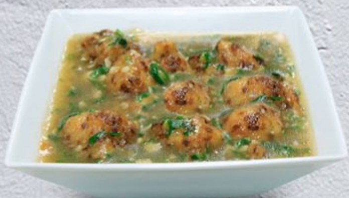
CV 06 VEGETABLE MANCHURIAN Tasty coated fried mixed vegetable balls in ginger, garlic and soy sauce 2.100