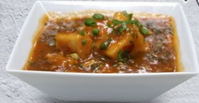
CV 02 TOFU IN SZECHWAN SAUCE Tasty fried tofu with hearty kick ginger, garlic, green chili and green onions in spicy szechwan sauce. 3.800