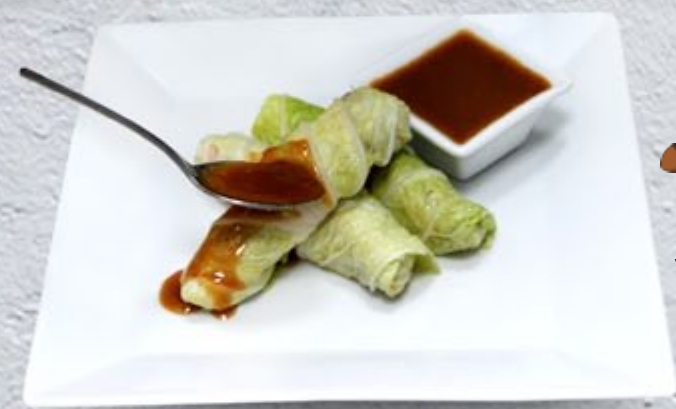
CV 05 VIETNAMESE MARINATED LETTUCE WRAP Zesty Vietnamese Honey marinated vegetables wrapped in Chinese cabbage served with Cogiavi mo dip 2.900