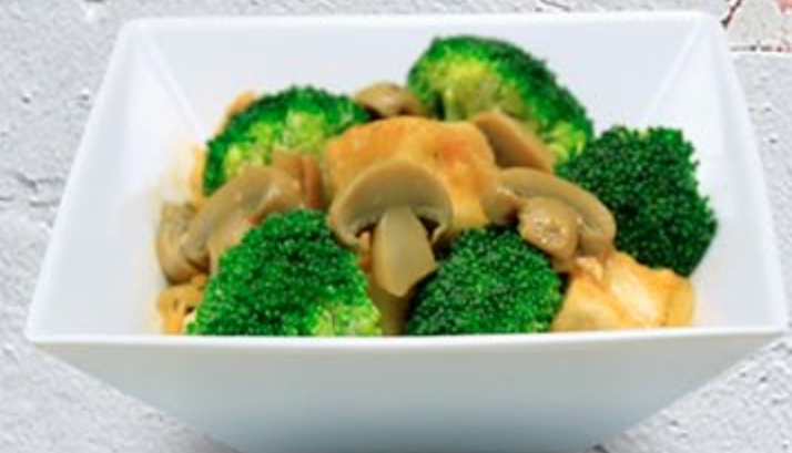
CV 07 STIR FRIED TOFU WITH BROCCOLI & MUSHROOM Chinese street style fried tofu with broccoli, mushroom, spring onions, garlic, ginger in hot oyster sauce 3.900