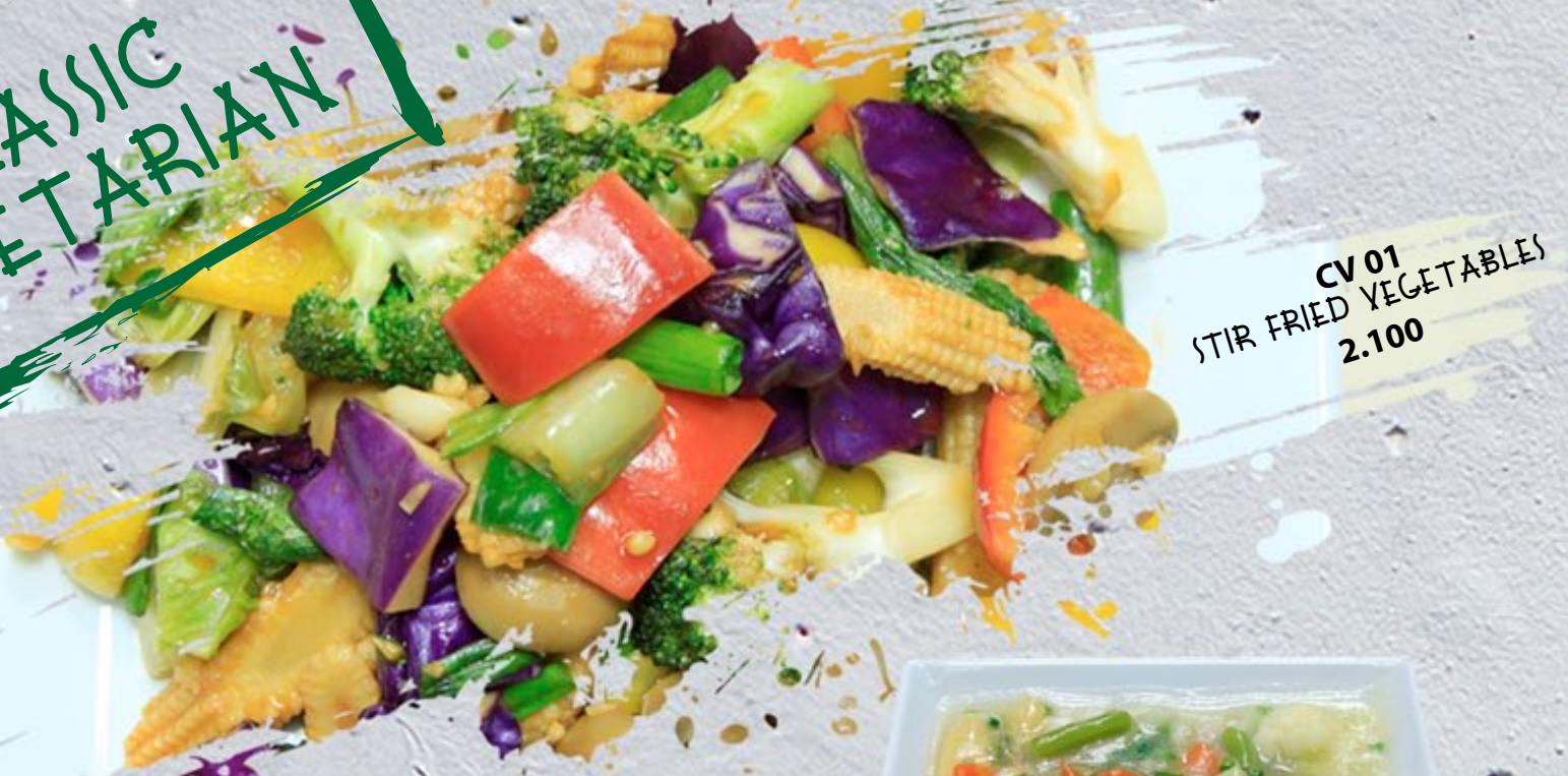
CV 01 STIR FRIED VEGETABLES 2.100